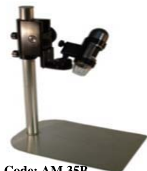
Code: AM 35B