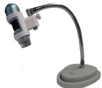
"AMITA" stand with flexible arm