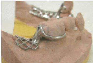
Gold Crown Contact