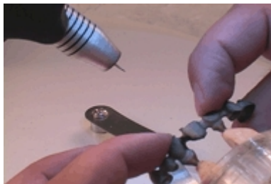
Implant Bar Welding