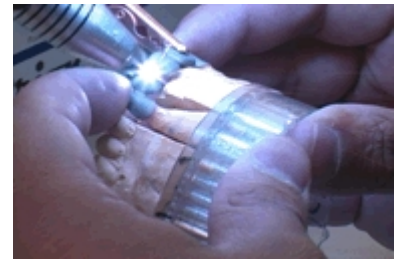
Fill Holes in Copings