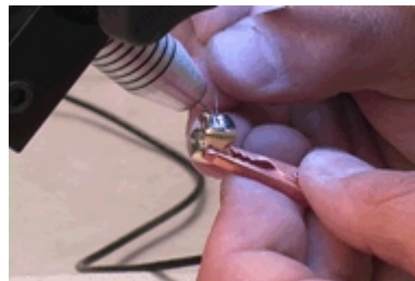
Adding Material to a Bridge